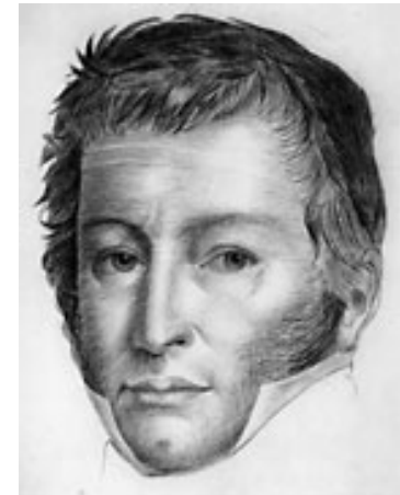
Heinrich Emanuel Merck