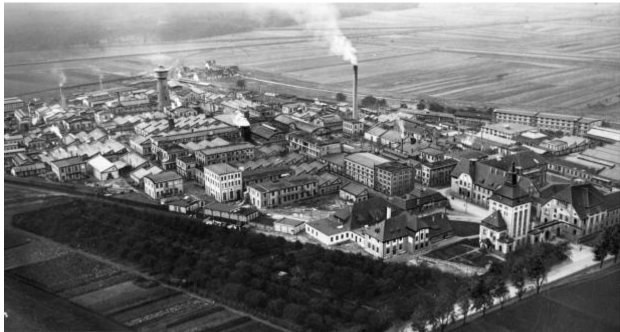
Factory in 1913

Relocation of the entire facility to its current location on Frankfurter Strasse